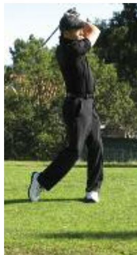
One of the golf champions