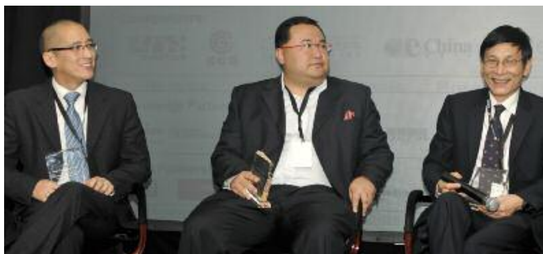
The three Chinese Business Leaders of the Year