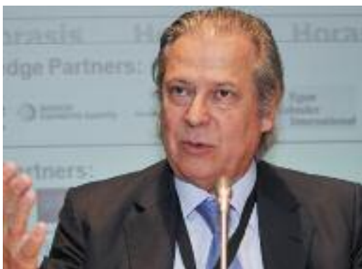
Jose Dirceu, former Chief Minister of Brazil, on the growing trade between China and Brazil

The Global China Business Meeting has had the merit of bringing this vision to civil society, highlighting business interests that are convergent and complementary from the standpoint of the Chinese companies and their counterparts from the Lusophone world. Indeed, as the Prime Minister of Mozambique Ms. Luisa Diogo pointed out, 'the Chinese do not invest in Mozambique because of the beautiful eyes of the Mozambicans, but rather due to the convergence and complementarity of interests' between the two countries. Besides, and more to the point, China sees all the Lusophone countries as forming a network based on language and culture, and geographically scattered through locations that are of the most strategic importance to