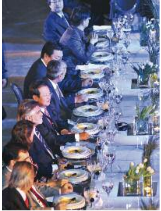
During the Welcome Dinner