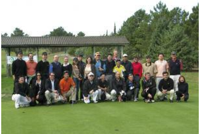
Participants of the first Global China Golf Tournament