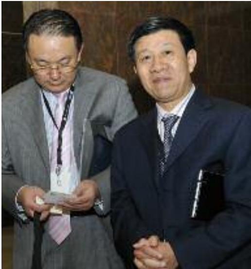
Community building - our vision at Horasis