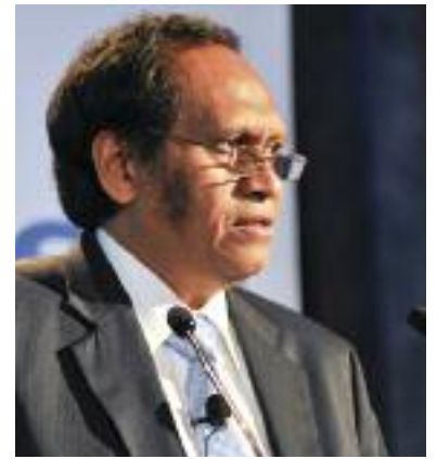
Jose Luis Guterres, Deputy Prime Minister of Timor Leste, addressing participants