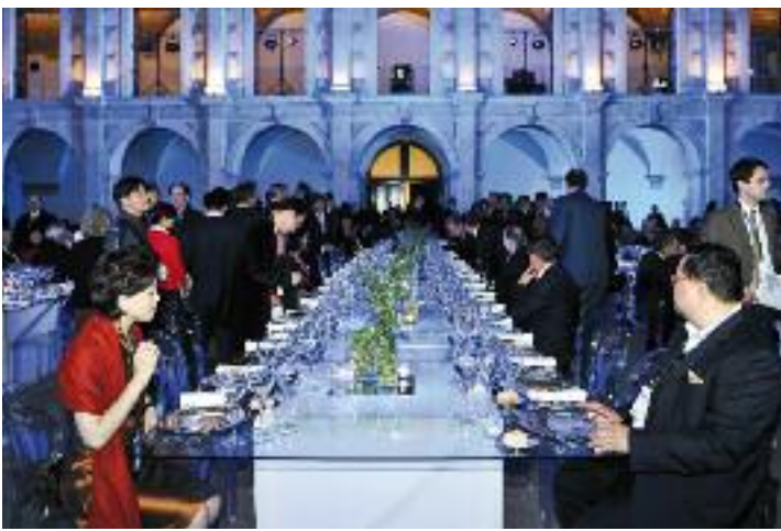
Participants prepare for the welcome dinner