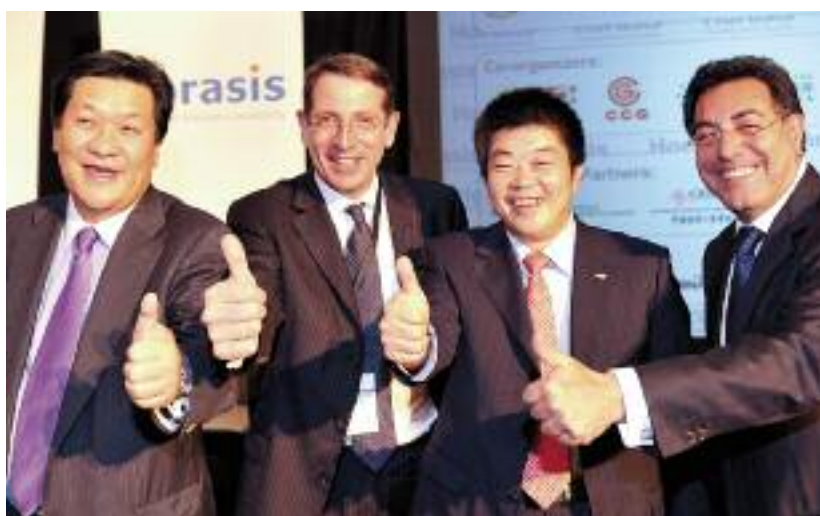
Celebrating a successful Global China Business Meeting