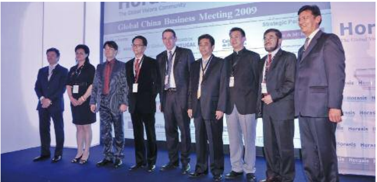
The co-organizers during the opening ceremony