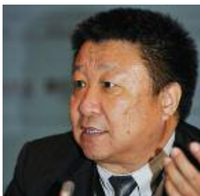
David Huang, Commissioner, Beijing Municipal Commission of Development