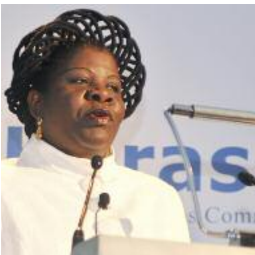
Luisa Dias Diogo, Prime Minister of Mozambique

At the close of the Fifth Global China Business Meeting, a panel of business leaders called for fundamental shifts in