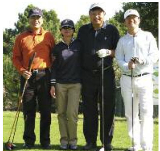
At the Golf Club Quinta do Peru