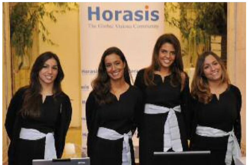
Horasis welcomes participants