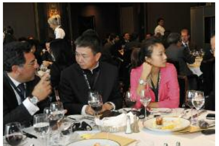
Getting to know each other over lunch