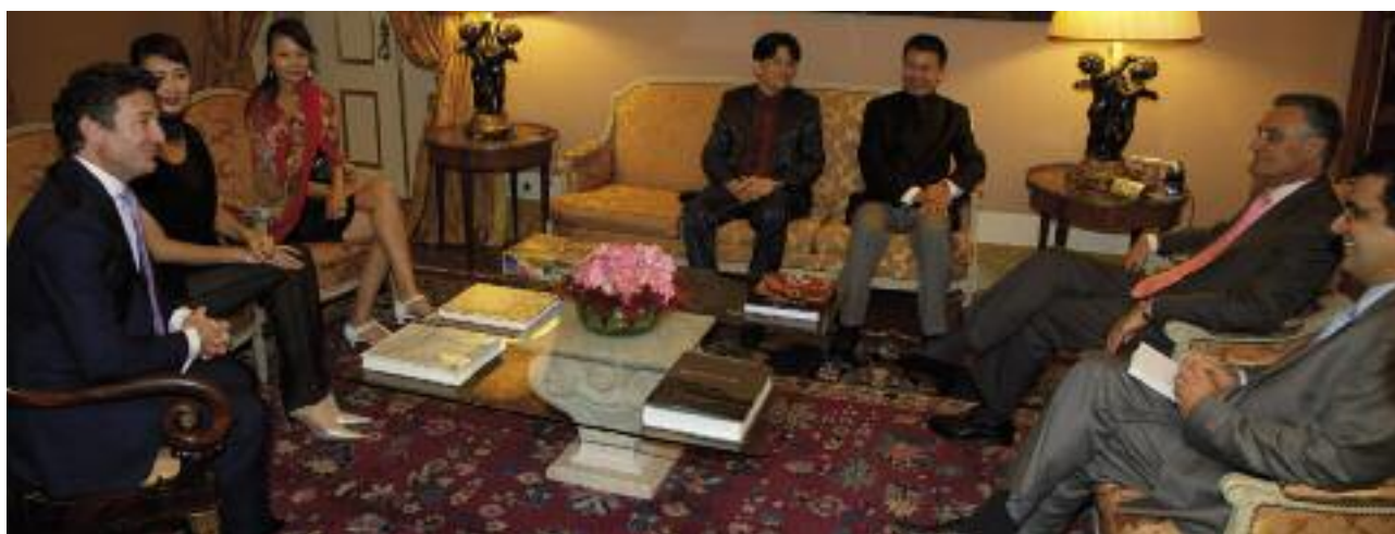
Aníbal António Cavaco Silva, President of Portugal, meeting a group of Chinese CEOs

Participants also celebrated the 30th anniversary of the establishment of diplomatic relations between China and Portugal. 'The establishment of the China-Portugal comprehensive strategic partnership in 2005 opened a new chapter in their relations,' said Luís Amado , Minister for Foreign Affairs of Portugal during his welcome address.