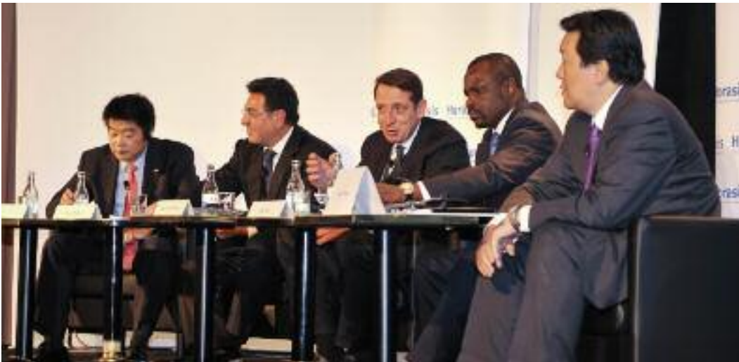
Closing plenary session - building global firms of Chinese origin

A new order is emerging from a credit crisis that put the world on edge - and China is playing an important and responsible role in this new order. The discussions at the Global China Business Meeting underlined that capitalism has been the engine of opportunities for innovators and risk takers, but that the system of unfettered free markets is under scrutiny. Globalization has enabled cross-border connections through technology and opened the channels for free trade and investment flows. Yet this model of integration is facing more regulation. 'The so-called Anglo-Saxon model of capitalism might be replaced by a model which favours long-term orientation instead of the usual practice of short-term profit