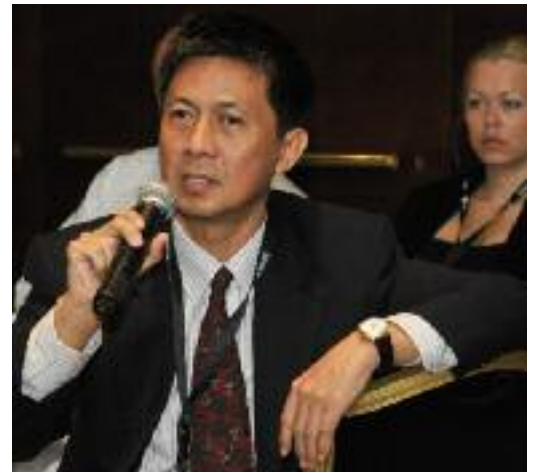
A participant asking a question during a boardroom dialogue session