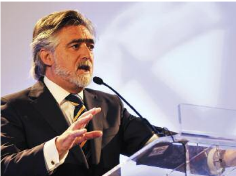
The Portuguese Minister of Foreign Affairs - reflecting on the success of China's 30 years of reforms

The Global China Business Meeting will hopefully continue to play a central role in the course of such a journey, with the Horasis network to come off larger and stronger.