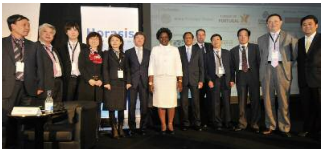
The Prime Minister of Mozambique with participants

Bertrand Russell was arguably the greatest Western philosopher of the 20th century, and certainly ranks among the immortals. His interests were broad; his understanding, deep; his accomplishments, legendary. Another mark of greatness: Even his failures ranged from noteworthy to spectacular. For example, in 1940 he failed to take up a professorship in philosophy at The City College of New York. The position had been offered and accepted, but was subsequently overturned by New York's Supreme Court, at a 'show trial' whose verdict had been pre-determined by mayor La Guardia, Episcopalian bishops, The New York Times, and the complicit trial judge himself. Russell had been hired by CCNY to teach logic and philosophy of science, but his advocacy of 'open marriage' scandalized New York's then-Puritanical ethos. (By today's standards, Russell would be a