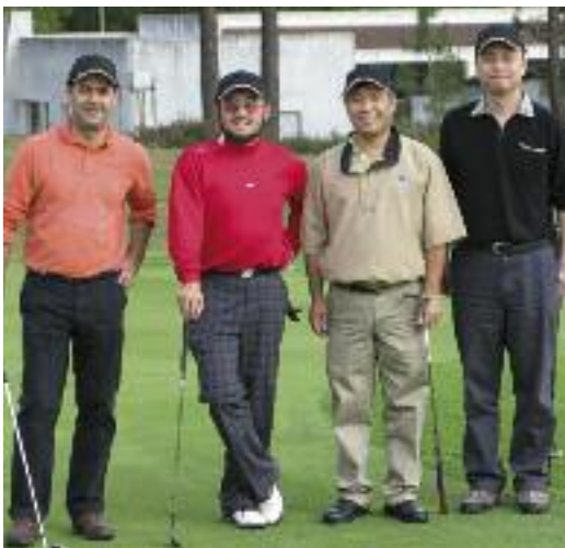
A day of fun and friendly competition