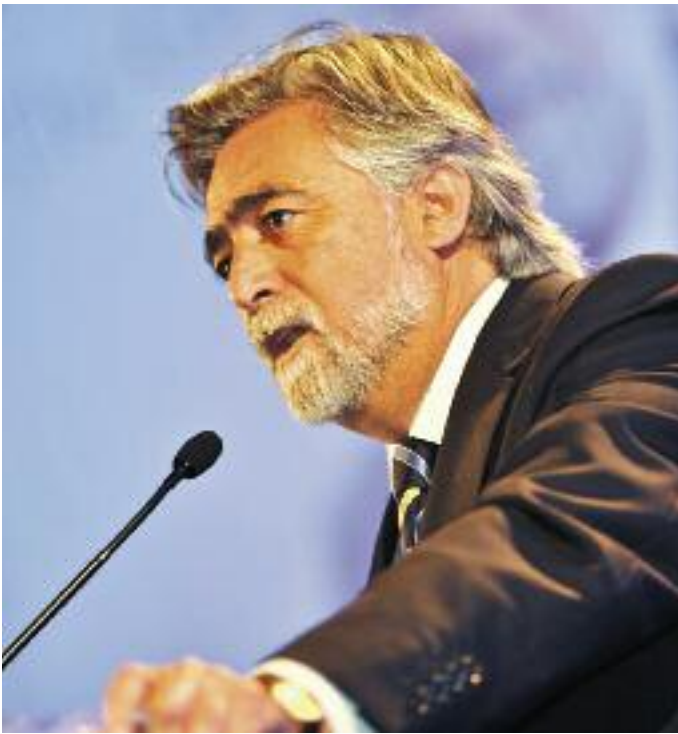
Luis Amato, Minister of Foreign Affairs, Portugal, welcoming participants

Aníbal António Cavaco Silva , President of Portugal, told group of Chinese CEOs that Portugal highly values its ties with China. The Global China Business Meeting was co-hosted by the Government of Portugal, represented by Aicep - Portugal's trade and investment agency - as well as Turismo de Portugal and Caixa Geral de Depósitos.