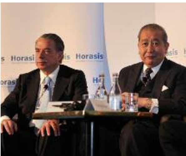
Opening plenary - is the global economic crisis truly behind us?